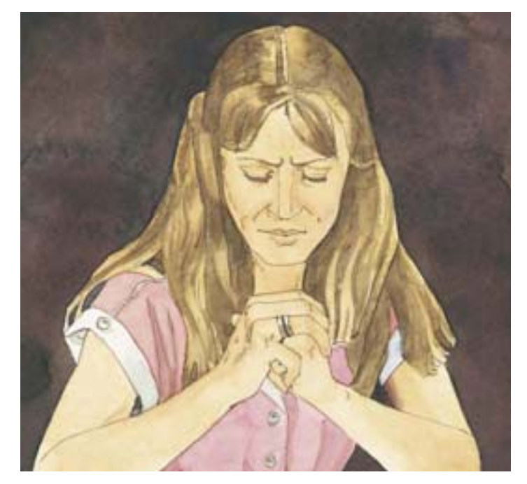
If it is wrong, they will not feel good in their hearts. Doctrine and Covenants 9:9