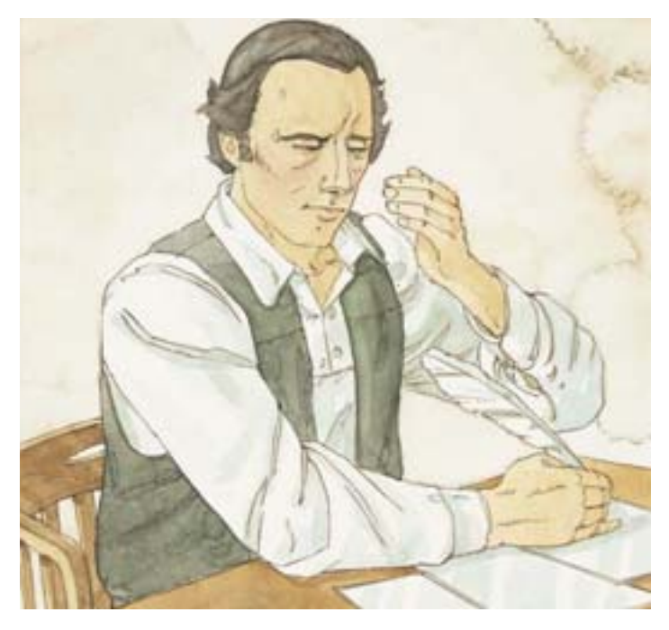
Oliver tried to translate. He thought it would be easy, but he could not do it. Doctrine and Covenants 9:1, 5, 7