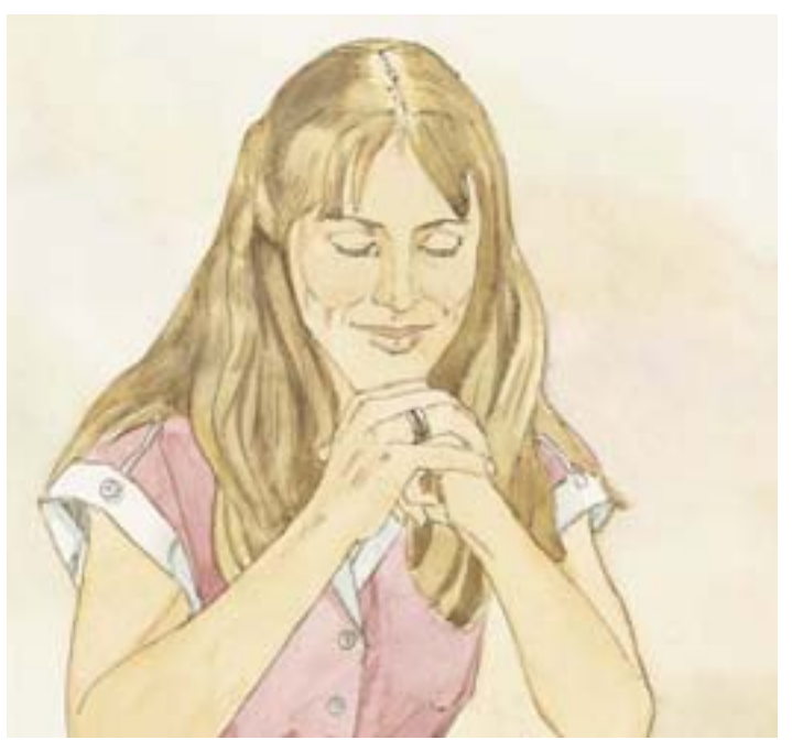
Then they should ask God if it is right. If it is right, they will feel good in their hearts. They will know it is right.