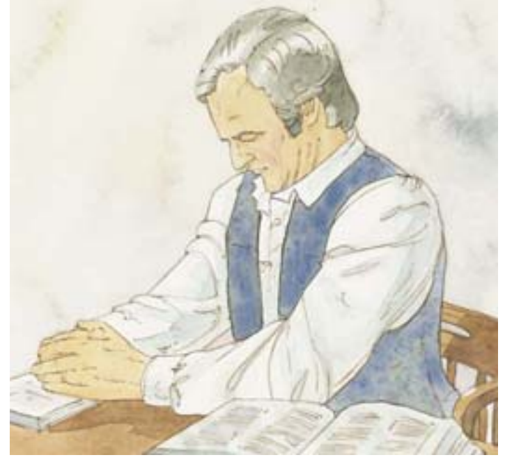
People who want to help Jesus should also pray and have faith. Jesus said people who help Him will be blessed.