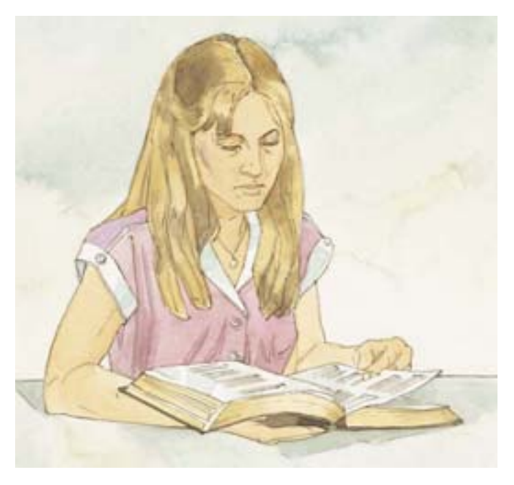
When people need help, they should think carefully about what to do. They should decide what they think is the right thing to do.