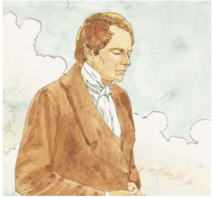
Joseph had to work on his farm. He also needed to translate the gold plates. It was too much work for him to do alone, so he prayed and asked Heavenly Father for help.