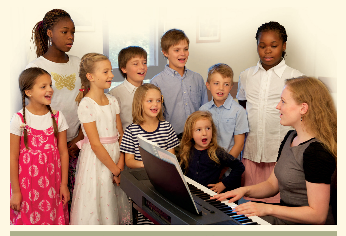
Week 4: I have a testimony that I am a child of God.

Writing a gospel principle will help the children rember it.