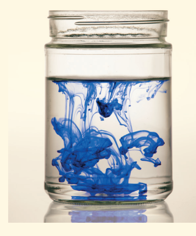
Object lessons create interest and focus the children's attention on a gospel principle.

Fill a clear container with water. Explain that each time we share the gospel, our testimony grows stronger. Put a drop of food coloring in the container. Give a few examples of how we can share the gospel, adding another drop of the same color of food coloring for each example. Point out that just as the color grows stronger with each drop of food coloring, our testimony grows stronger each time we share the gospel.