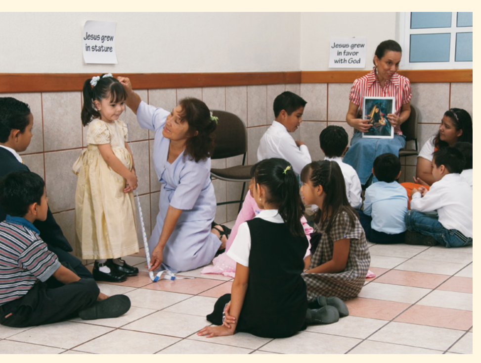
In this activity, children can relate to Jesus Christ by recognizing that He grew as they do.

Identify the doctrine ( singing a song and memorizing a scripture ): Display pictures showing Christ's progression from infant to child to adult. Sing together "Jesus Once Was a Little Child" ( CS , 55), and ask the children to explain what the song teaches about Jesus. Help the children memorize Luke 2:52 by using simple actions to represent the ways Jesus grew: in wisdom ( point to head ), in stature ( flex muscles ), and in favor with God ( fold arms ) and man ( wave to a friend ).