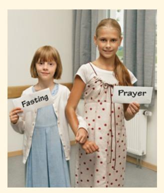
Wordstrips available at sharingtime.lds.org

Song: "The Wise Man and the Foolish Man" (CS, 281) or a song of your choice from the Children's Songbook