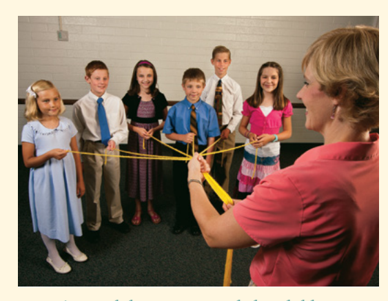
A visual demonstration helps children understand abstract concepts.

other end of each piece of string in your hand. At the end of the discussion, ask the children holding the strings to come to the middle of the room and twist all of their pieces of string together, making a