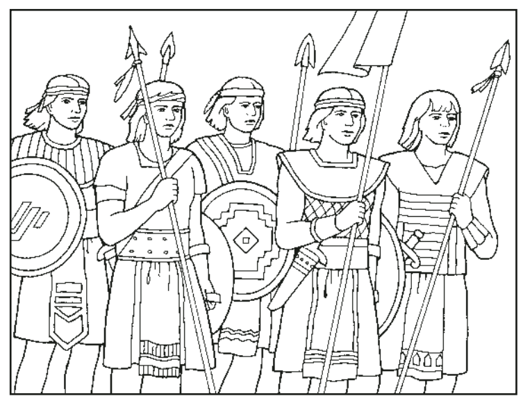
"They are young, and their minds are firm, and they do put their trust in God continually." Alma 57:27