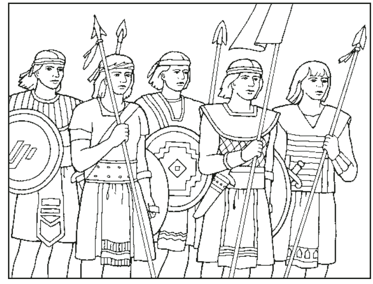
"They are young, and their minds are firm, and they do put their trust in God continually." Alma 57:27