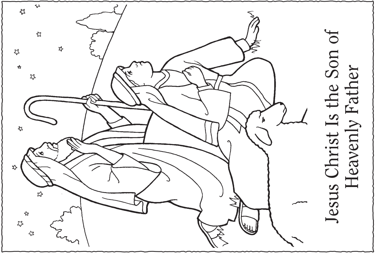
Jesus Christ Is the Son of Heavenly Father