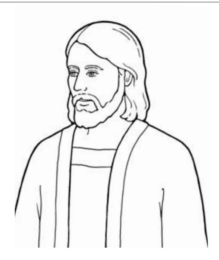
The sacrament helps me think about Jesus.