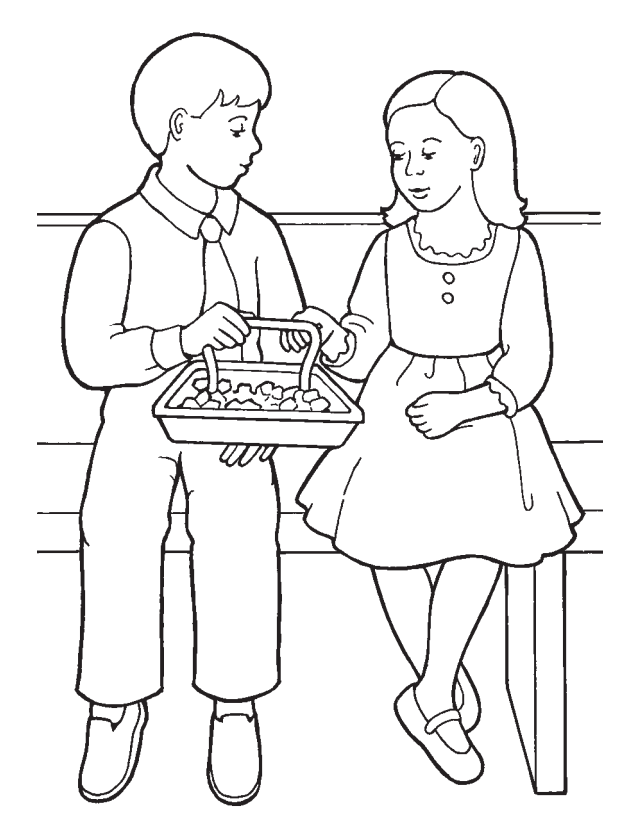
I can think of Jesus when I eat the bread.

I can think of Jesus when I drink the water.