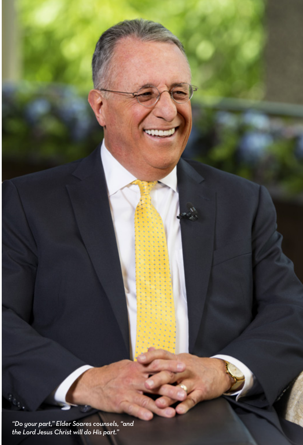
“Do your part,” Elder Soares counsels, “and the Lord Jesus Christ will do His part.”

“WE MUST HOLD EVER MORE TIGHTLY TO OUR TESTIMONY OF THE GOSPEL OF JESUS CHRIST. THEN WILL OUR ABILITY TO DEFEND TRUTH AND JUSTICE GREATLY INCREASE. WE WILL WIN THE DAILY BATTLES AGAINST EVIL, AND... WE WILL RALLY OTHERS TO THE MASTER'S STANDARDS.”