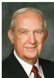
By Elder Richard G. Scott