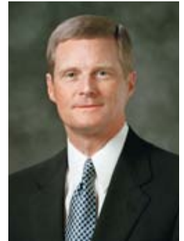
By Elder David A. Bednar Of the Quorum of the Twelve Apostles

I believe many of us unknowingly accept a faulty assumption about the Lord’s pattern. And this faulty assumption then produces erroneous expectations about how we receive spiritual knowledge. And that faulty assumption and our misinformed expectations ultimately hinder our ability to recognize and respond to the promptings of the Holy Ghost. Let me suggest that many of us typically assume we will receive an answer or a prompting to our earnest prayers and pleadings. And we also frequently expect that such an answer or a prompting will come immediately and all at once . Thus, we tend to believe the Lord will give us A BIG ANSWER QUICKLY AND ALL AT ONE TIME . However, the pattern repeatedly described in the scriptures suggests we receive “line upon line, precept upon