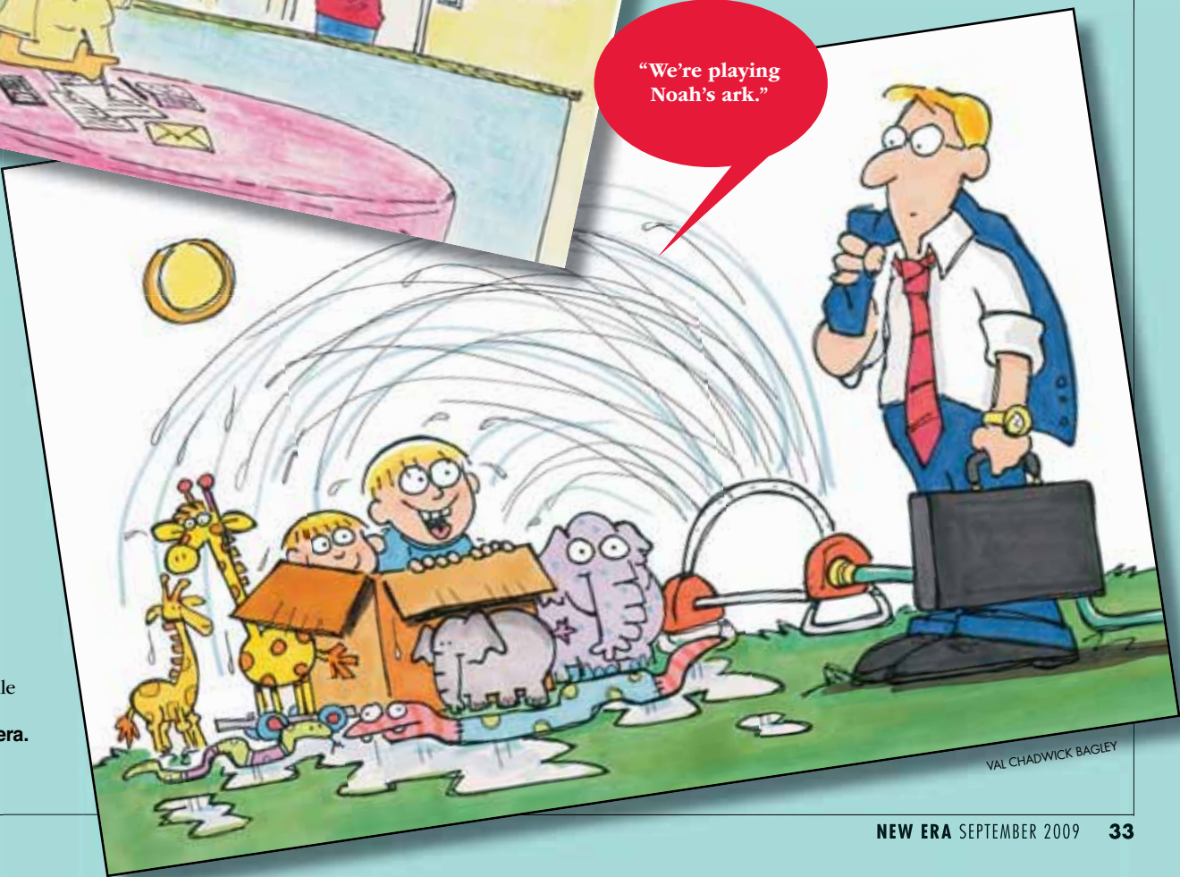
VAL CHADWICK BAGLEY

NEmore See a differ- ent Extra Smile online every week at newera.lds.org .