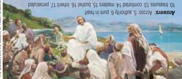
THE SERMON ON THE MOUNT, BY HARRY ANDERSON

Answers: Across: 5. authority 6. pure in heart 7. righteousness 8. kingdom 9. enemies 11. hypocrite 12. light 10. treasures 13. comforted 14. masters 15. bushel 16. inherit 17. persecuted Down: 1. pearls 2. merciful 3. judged 4. repetitions 6. peacemakers 7. righteousness