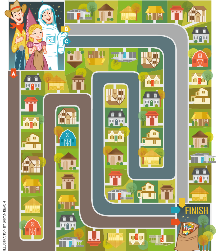
ILLUSTRATION BY BRYAN BEACH

These twin brothers have decided it's the last year they can go trick-or-treating with their little sister. They want to make sure she gets the maximum possible candy haul. Which proposed path will take them by the most homes?