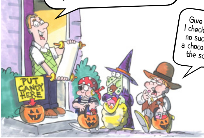
VAL CHADWICK BAGLEY

Give it up, Dad. I checked. There's no such thing as a chocolate tax in the scriptures.