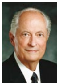
By Elder Robert D. Hales