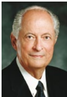
By Elder Robert D. Hales