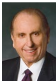
President Thomas S. Monson