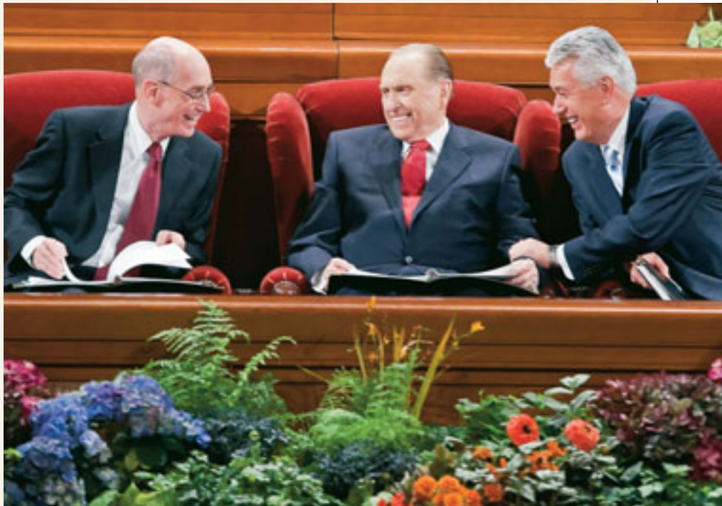
President Thomas S. Monson (center), President Henry B. Eyring (left), and President Dieter F. Uchtdorf (right) talk before a session of general conference.

"We remind you that the messages we have heard during this conference will be printed in the November issues of the Ensign and Liahona magazines. As you read and study them, you will be additionally taught