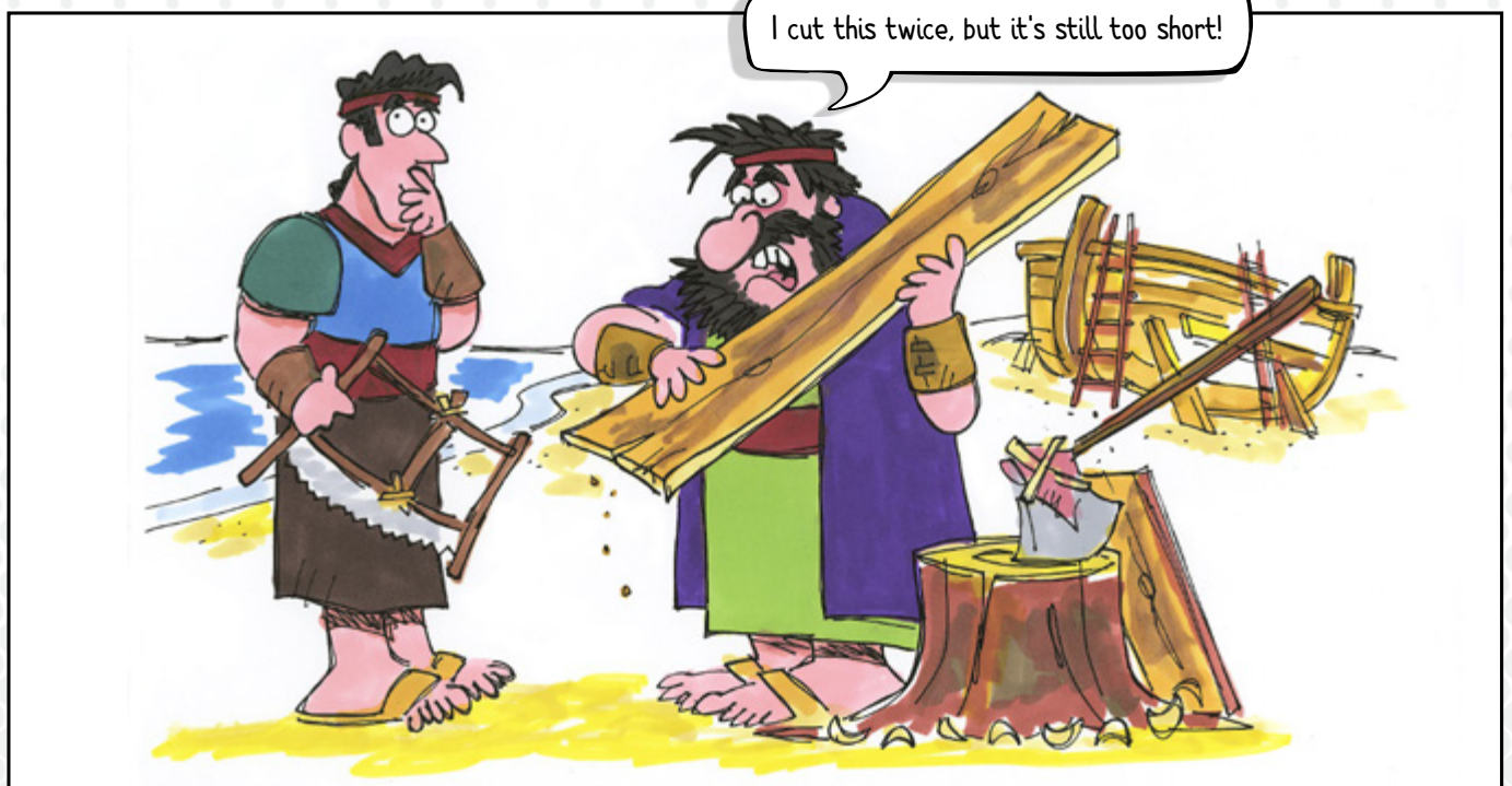
VAL CHADWICK BAGLEY

ANSWERS (FROM PAGES 12-13) DECIPHER THE CONFERENCE QUOTE: When we are partially in or not in at all, there is, in the Star Wars vernacular, "a disturbance in the force." HYMN-TASTIC MATCHING: 1H, 2F, 3A, 4G, 5B, 6C, 7E, 8D CHORAL RIFF: BASS FISHING CONFERENCE CROSSWORD: Across: 5, overcome / 7, worthy / 8, testing / 9, receive / 10, kind / 13, heliographic / 15, Book of Mormon / 17, saw / 19, sure / 20, all in / 21, sin / 22, fear / Down: 1, The Living Christ / 2, Godhead / 3, loss / 4, part-time / 6, return / 7, war / 11, honor / 12, up / 14, choir / 16, France / 17, sins / 18, warm WATCH AND WARN: Coolsville—locusts, trumpet; Awesometown—stampedes, clarinet; Utopia—army, viola; Funland—tornadoes, snare drum