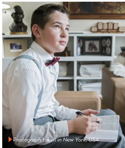
▶ Photograph taken in New York, USA