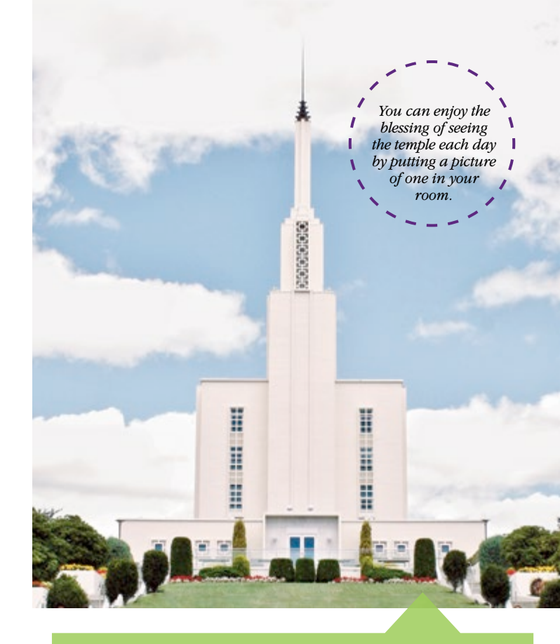
"How peaceful it was to just turn and look at [the temple] standing in front of you."

That might sound at first like there was a lot of downtime and waiting in between. But nothing could be further