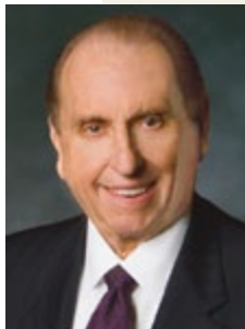
President Thomas S. Monson

“May we long remember the messages we have heard [at this conference],” urged President Monson. “As we receive the issues of the Ensign and Liahona magazines which will contain these messages in written form, may we read and study them.”