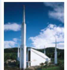
Guatemala City Guatemala