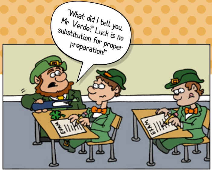
ARIE VAN DE GRAAFF

What kind of music does a leprechaun band play? To find out, put the four-leaf clovers in order from completely empty to completely filled in. Copy the letters into the spaces once you have the order figured out.