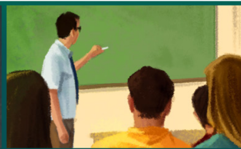
This helped me provide a good education for my children.