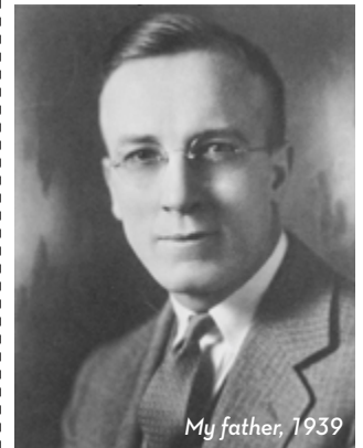
My father, 1939