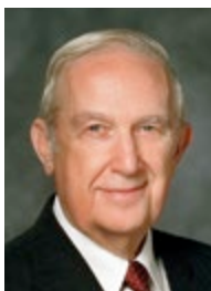
By Elder Richard G. Scott Of the Quorum of the Twelve Apostles

What sometimes seems an impenetrable barrier to communication is a giant step to be taken in trust.