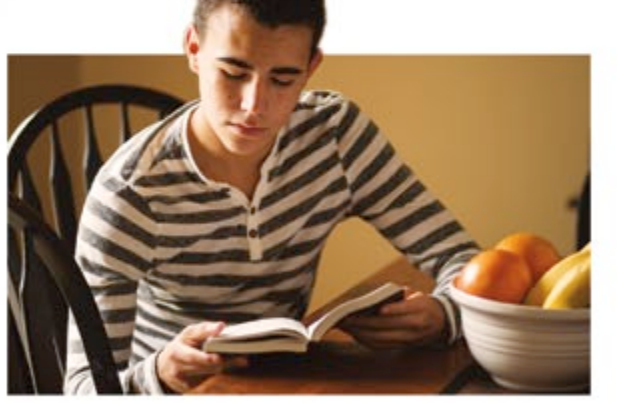
Like anything, you have to approach Church history with balance.

Certainly, the world has changed in the last generation or two. The