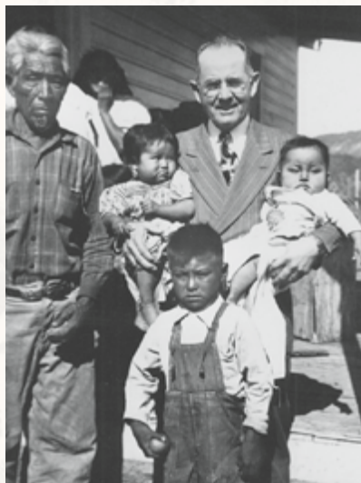
Elder Spencer W. Kimball, who later became President of the Church, had a great love for Native Americans.

Before graduating from BYU, I read Elder Kimball’s words again about seeing Native Americans as lawyers looking after their people. I decided to go to law school and become a lawyer. I’m grateful for the opportunities I’ve had to use my education to help others. I have also been elected to several