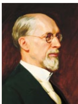
By President George Albert Smith (1870–1951)

George Albert Smith, eighth President of the Church, was born on April 4, 1870. He was called as an Apostle in 1903 and became President of the Church in 1945. He died in 1951 on his 81st birthday. At the time this conference address was given in 1916, the world was in the midst of World War I and George Albert Smith was an Apostle.