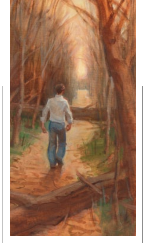
A priesthood blessing is of great significance in helping us overcome obstacles on the path to eternal life.

Priesthood blessings are also pronounced on places. Nations are blessed and dedicated for the preaching of the gospel. Temples and houses of worship are dedicated to the Lord by a priesthood blessing. Other buildings may be dedicated when they are used in the service of the Lord. "Church members may dedicate their homes as sacred edifices where the Holy Spirit can reside."2 Missionaries and other priesthood holders can leave a priesthood blessing upon homes where they have been received (see Alma 10:7-11; D&C 75:19). Young men, within a short time you may be asked to give such a blessing. I hope you are preparing yourselves spiritually.