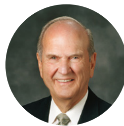
By President Russell M. Nelson President of the Quorum of the Twelve Apostles

Not only do I now have a greater testimony of the Lord and Savior, Jesus Christ, but I also have a reaffirmation of my absolute conviction that the system Joseph Smith had for translating the Book of Mormon was a gift from God.