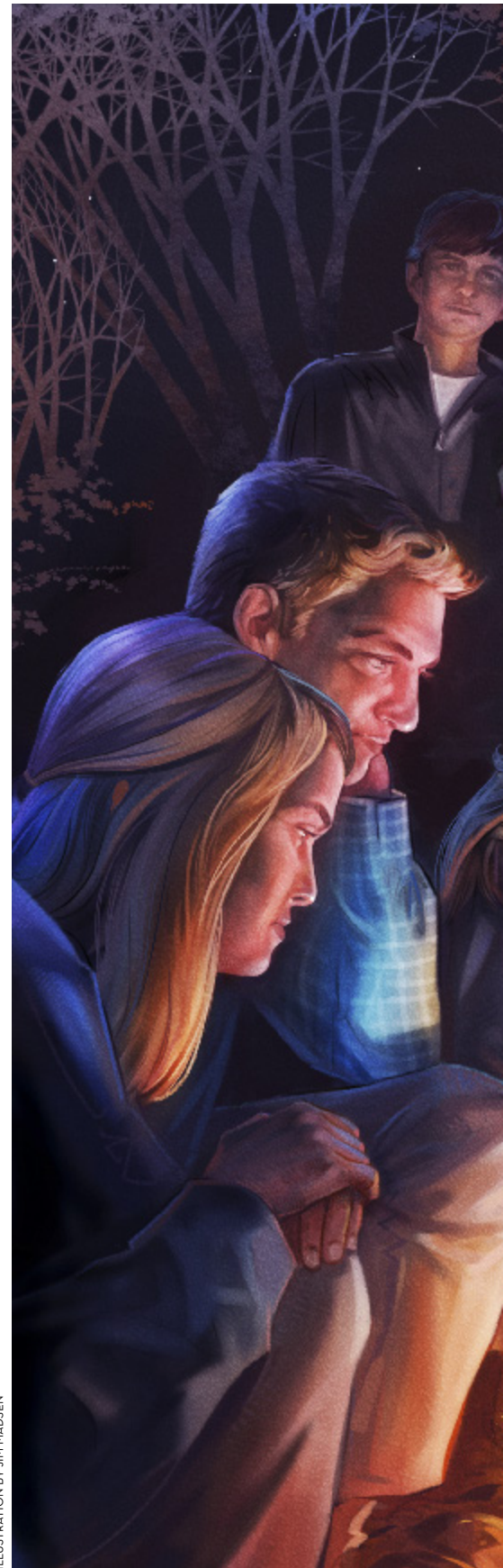
ILLUSTRATION BY JIM MADSEN