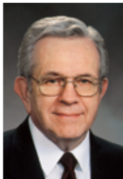
By President Boyd K. Packer

President of the Quorum of the Twelve Apostles