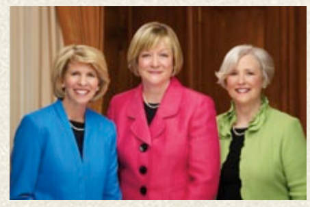
Young Women General Presidency

This invitation is not a one-timeonly event; it is a process. We are invited to follow a pathway that will lead us to the temple, where we make additional covenants with our Father in Heaven and participate