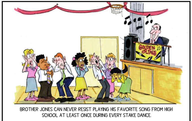
BROTHER JONES CAN NEVER RESIST PLAYING HIS FAVORITE SONG FROM HIGH SCHOOL AT LEAST ONCE DURING EVERY STAKE DANCE.

'Legendary'? 'Epic'? It's possible you've been reading too many fantasy novels lately. Go to the dance for a change of pace and to teach dance moves to your friends.