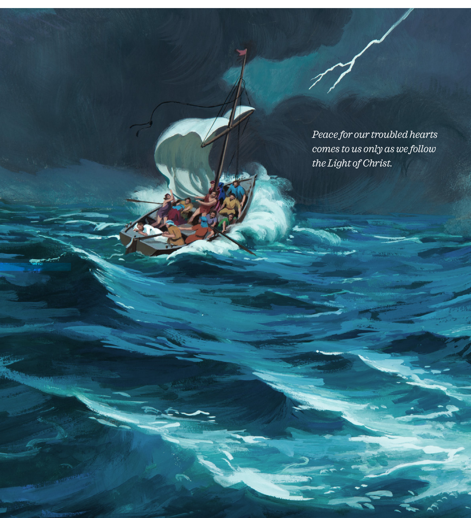
ILLUSTRATION FROM REVIEW & HERALD PUBLISHING/LICENSED FROM GOODSALT.COM