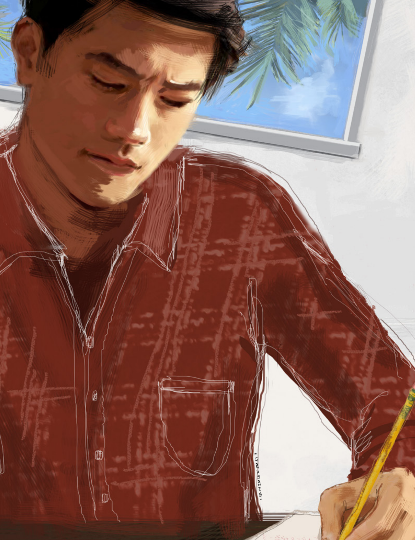
ILLUSTRATION BY RED HANSEN