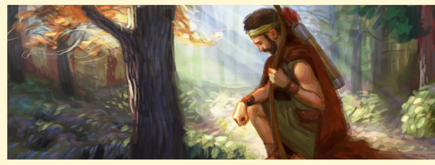
The Lord covenanted with Enos to preserve and bring forth the scriptures "in his . . . due time" (Enos 1:16).

and us to understand the importance of the scriptures, especially Isaiah's prophecies about the Restoration of the gospel and the coming forth of their record—the Book of Mormon—in our day.