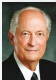
By Elder Robert D. Hales Of the Quorum of the Twelve Apostles