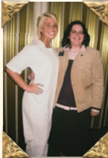
Catlin and a missionary at baptism