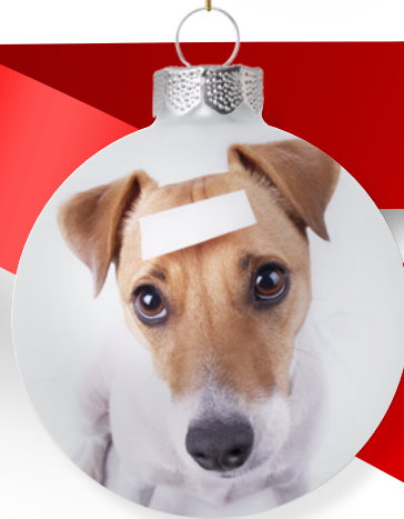
PHOTO OF DOG