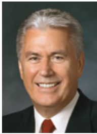
By President Dieter F. Uchtdorf Second Counselor in the First Presidency