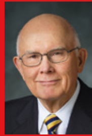
By Elder Dallin H. Oaks Of the Quorum of the Twelve Apostles