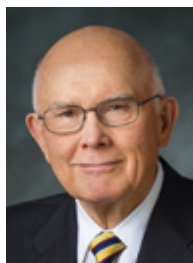
By Elder Dallin H. Oaks