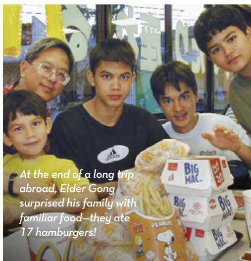
At the end of a long trip abroad, Elder Gong surprised his family with familiar food—they ate 17 hamburgers!

Elder Gerrit W. Gong, "Strengthen One Another in the Lord" (Brigham Young University Women's Conference address, May 4, 2018), 6, womensconference.byu.edu/transcripts .