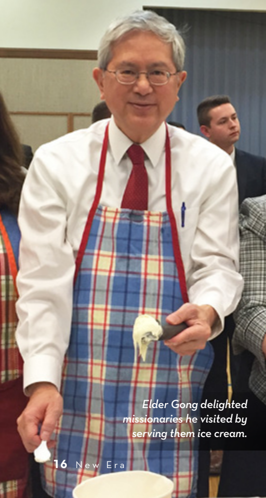
Elder Gong delighted missionaries he visited by serving them ice cream.

W hen Elder Gerrit W. Gong was a young man, he really wanted to play school basketball. “I practiced and practiced,” he said. “One day the coach pointed to our 6-foot-4-inch (1.93 m) all-state center and our 6-foot-2-inch (1.88 m) all-star forward and said to me, ‘I can put you on the team, but you’ll likely never play.’ I remember how kindly he then encouraged, ‘Why not try out for soccer? You’d be good.’ My family cheered when I scored my first goal.” 1