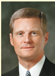
By Elder David A. Bednar Of the Quorum of the Twelve Apostles