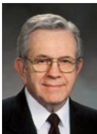
By President Boyd K. Packer

If you have stumbled or even been lost for a time, you can move forward with faith and not wander to and fro in the world any longer.