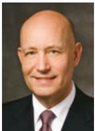
By Elder Per G. Malm Of the Seventy

The blessings of hard work and service go beyond just temporal help.